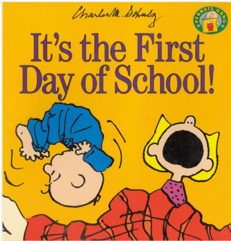
Charles M. Schulz, It's the First Day of School! (Peanuts Gang), 1996